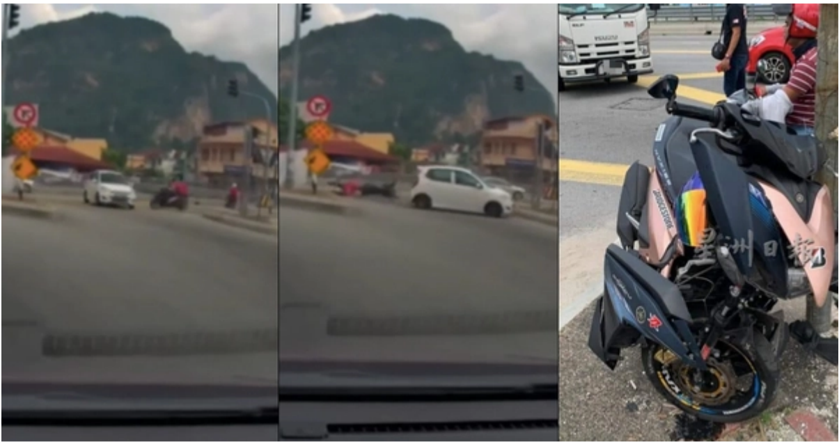
Car In Sri Gombak Suspected Of Running A Red Light Causes Delivery Rider To Crash Into It