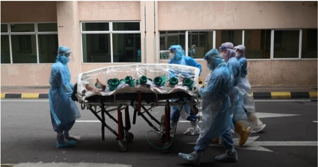
Malaysia Inches Closes To 7K Mark After Recording 6,976 New COVID-19 Cases In A Day