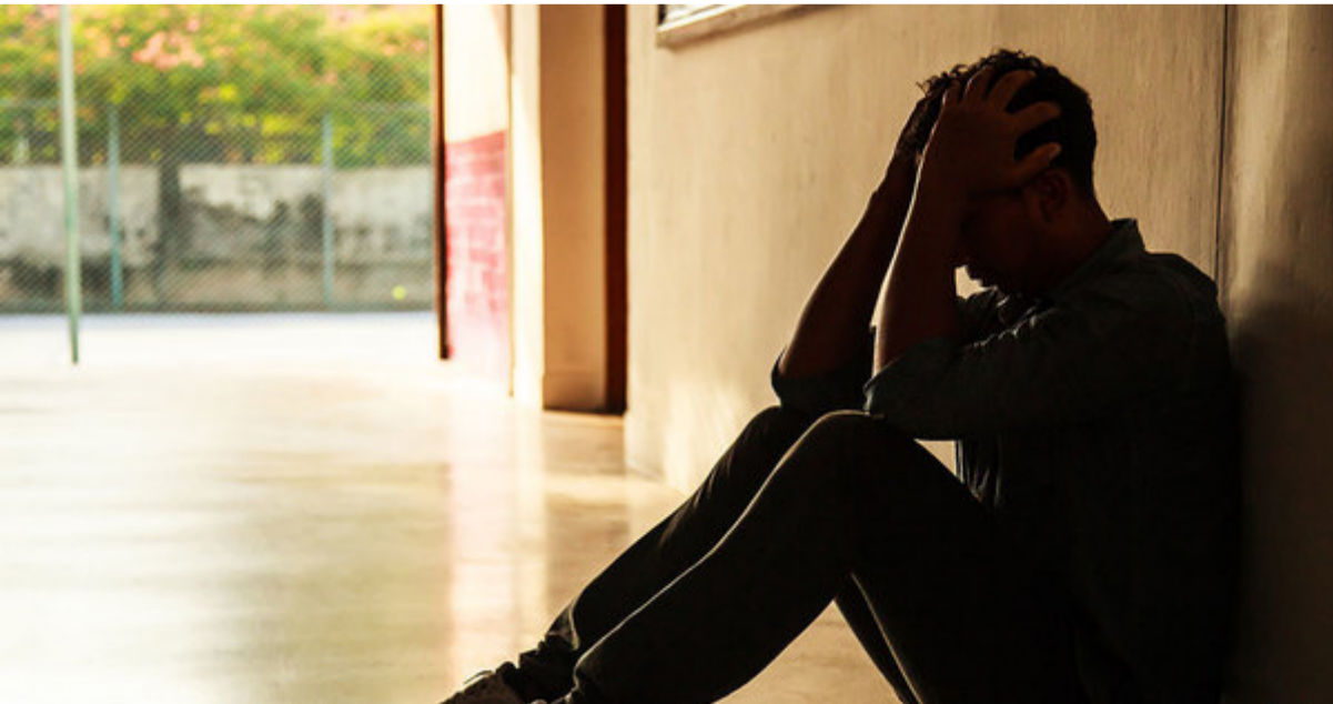
MOH Data Shows The Pandemic's Severe Psychological And Emotional Effect On Malavsians