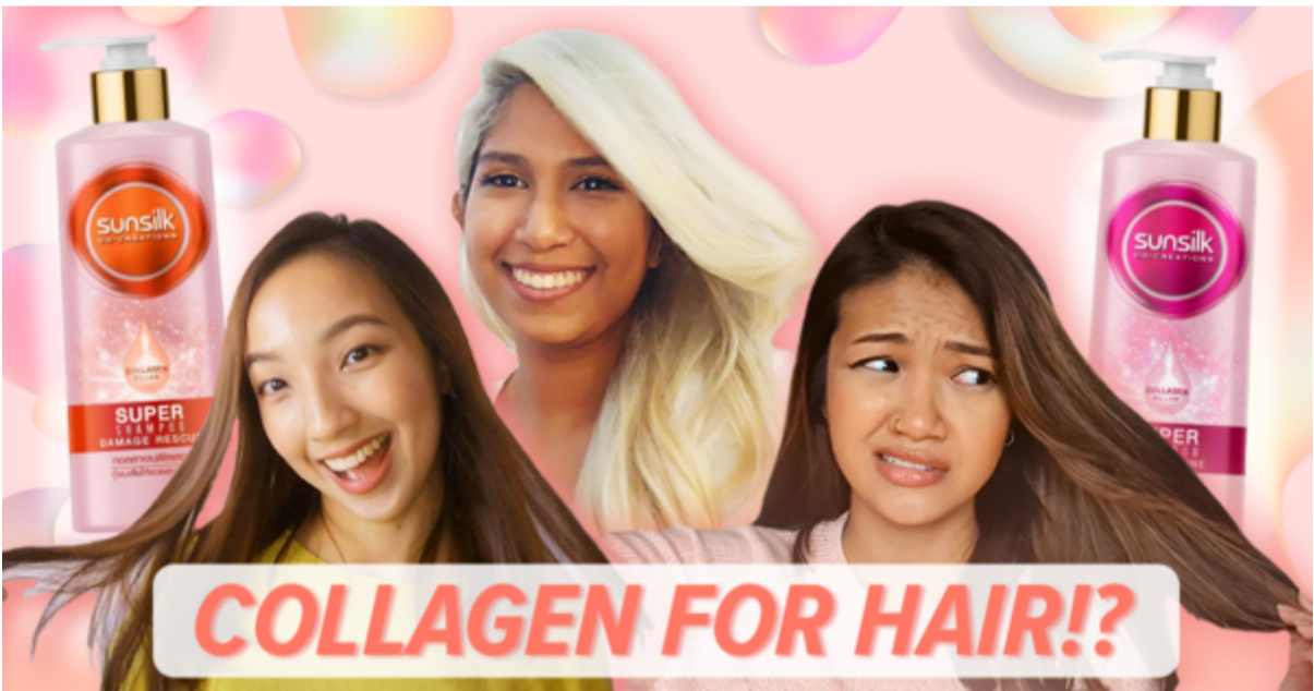
[VIDEO] Malaysians Try Sunsilk's New Collagen Shampoos & Conditioners. What's The Verdict?